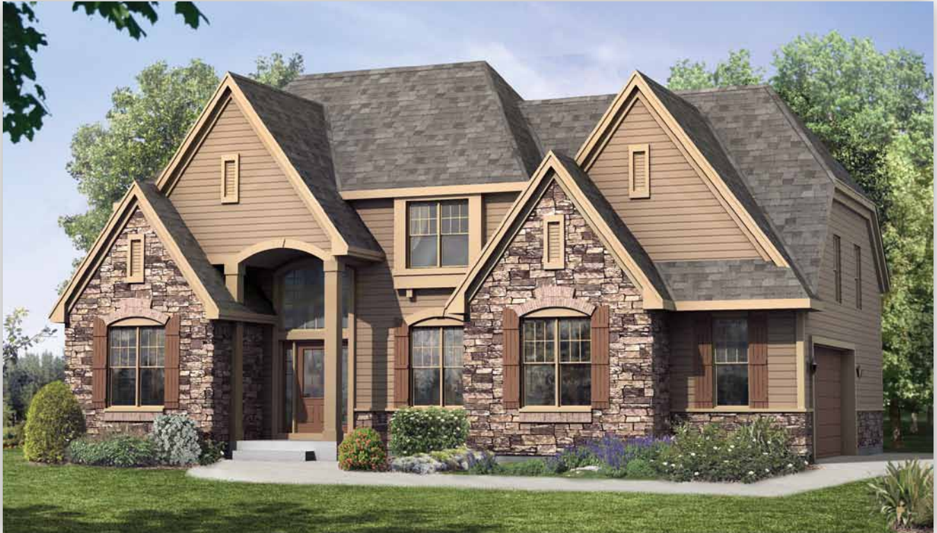
◆ FRENCH COUNTRY