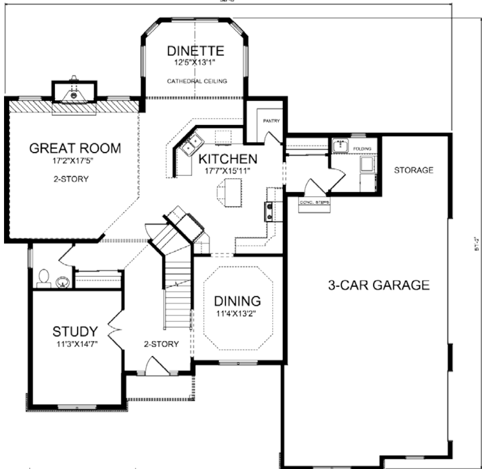
1st Floor 1,489 Sq. Ft.