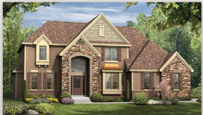
◆ FRENCH COUNTRY

The front elevation shown above is an artist's rendering and for illustrative purposes only. All floor plans, exterior renderings and dimensions are approximate and subject to change. Standard floor plans and elevations may differ from those shown based on modifications, options and improvements. Contact salesperson for standard features. Prices and specifications are subject to change without notice or obligation.