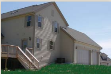
3 Car Garage on Two Story Homes