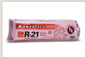
R-50 & R-21 Insulation