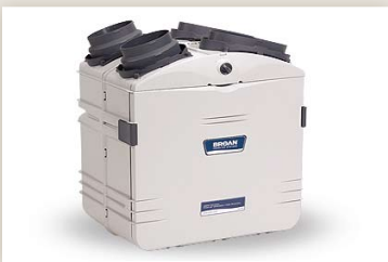
Heat Recovery Air Exchanger