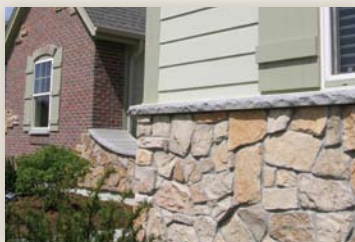
Stone Exterior per Elevation