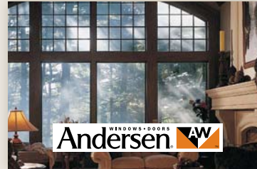
Andersen Wood Windows