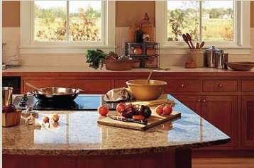
Granite Kitchen Counters