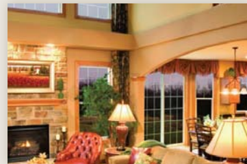
All Painting and Staining