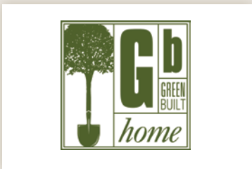
Green Built Homes